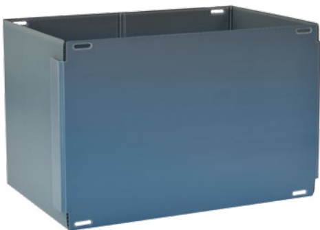
foldable Con-Pearl ® pallet sleeve