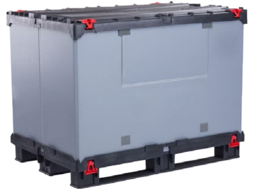
Con-Pearl ® bulk container