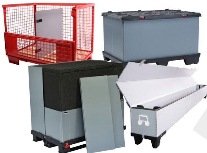
Con-Pearl ® packaging solutions for refrigerated transports, bulk materials, long goods, etc.